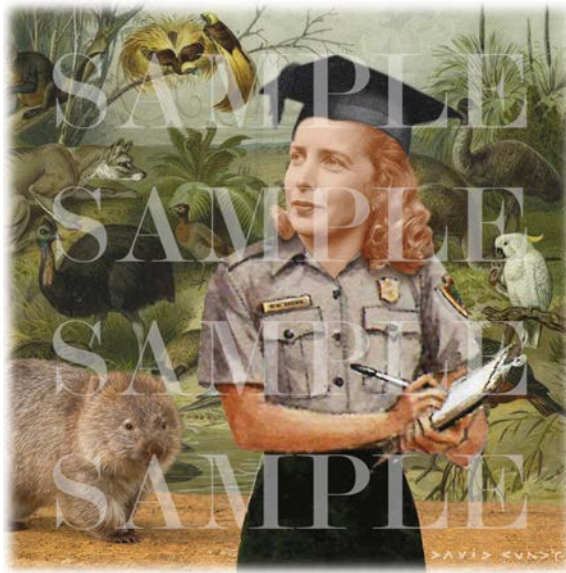
WISER WOMBAT RANGER / MARGARET WISE BROWN